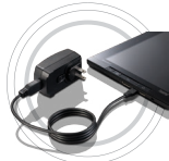
ThinkPad 8 10W AC Charger