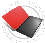
ThinkPad 8 Quickshot Cover