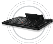
ThinkPad Compact Bluetooth Keyboard