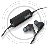
ThinkPad Noise Cancelling Earbuds